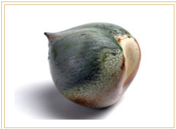
Eva Kwong Buckeye Immortal Peach-A