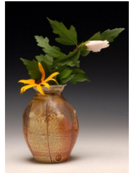
Dick Lehman Wood-fired Vase #1